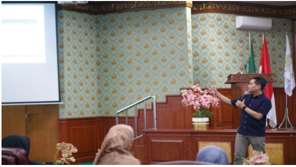
Figure 1. Implementation of Activities

This activity was held on December 12, 2023. Participants in this activity were students of the Universitas Islam Negeri Sultan Syarif Kasim Riau who have the potential to publish scientific papers in reputable journals. This activity began by introducing Sinta to the participants. This was done because not all participants were familiar with this platform. Sinta is a platform managed by the Ministry of Education and Culture of the Republic of Indonesia. Sinta is designed to index and assess scientific journals, articles, and publications from various disciplines in Indonesia. Sinta aims to improve the quality of scientific publications and promote research in Indonesia. Sinta has three main functions, including: