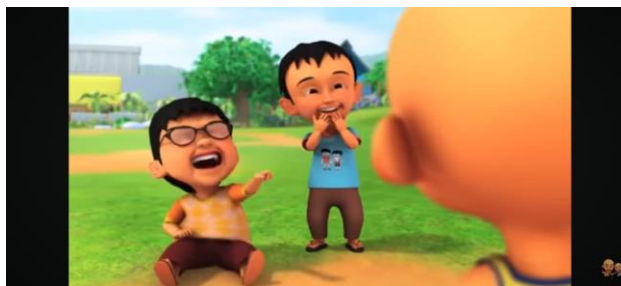
Figure 4 Visuals for one aspect of a humourous scene

The verbal communication in the episode of the animated series Upin and Ipin – Gong Xi Fa Cai contains all six aspects of verbal communication and it can be concluded that the highest total score is the short and clear aspect with a total score of 98% and the lowest score of the humor aspect of 8%. Apart from these two aspects, this animated series also includes word for word in effective communication that makes the dialogue in the episode understandable. The speed of his speech is also adjusted according to what is communicated in the dialogue is not fast and not slow. The intonation of the voice conveyed in the dialogue can also contain a dramatic message. Likewise, regarding time in the conversation, they are willing