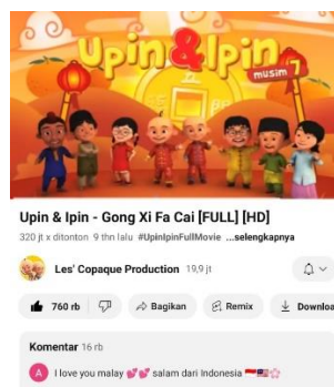
Figure 2 Episode Upin and Ipin - Gong Xi Fa Cai

The animated series Upin and Ipin is an animation produced by Les' Copaque Production , on September 14, 2007 which at that time aired the first episode of the animated series Upin and Ipin. From his social media account, youtube whose series has the most viewers from the Malay category, namely the episode of the series Upin and Ipin – Gong Xi Fa Cai. The episode tells about the Chinese holiday which at that time was commemorating the Chinese New Year, where one of the characters of the animated series, namely May-May, a friend of Upin and Ipin, is the child of Tingkhwa who is also celebrating his big day.