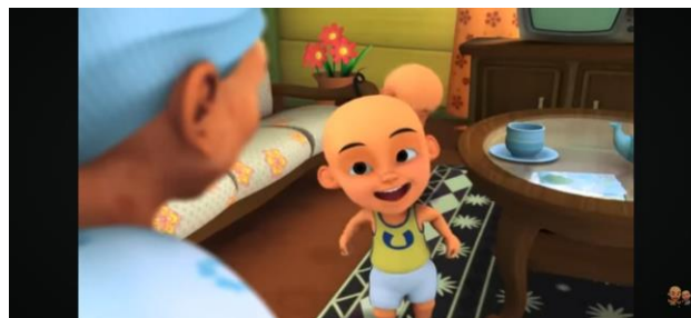
Figure 3 The visuals of one aspect of the scene are concise and clear