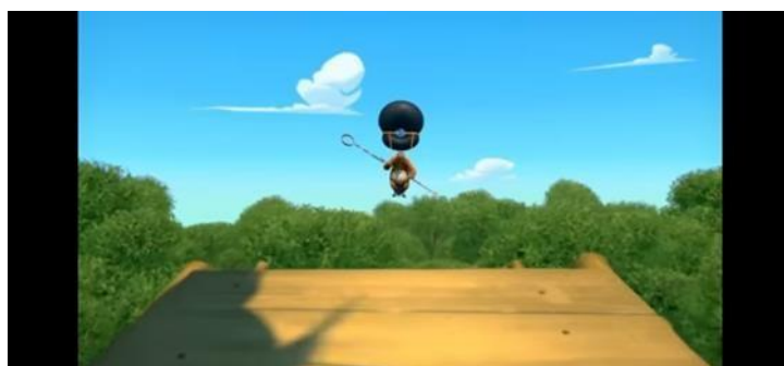
Figure 4.13 Scene 5.26

Public distance: Around 12 feet. Grizzly chases angrily, Grizzly wants to get the parrot that brings lemmings, so he can hear music anywhere and anytime.