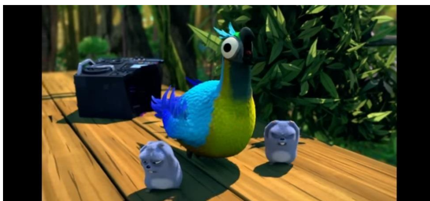
Figure 4.5 Scene 3.32

E. Adapter, which is a gesture that refers to the release of tension and other forms. Is behavior that is done to create a sense of comfort when facing a test, for example sucking candy, scratching the head, correcting the position of glasses. This behavior can be done consciously or unconsciously.