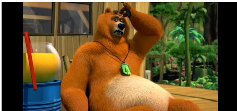
Figure 4.4 Scene 2.28

Nonverbal : Shaking his head left and right, and moving his eyes left and right. While sounding ha..a...a