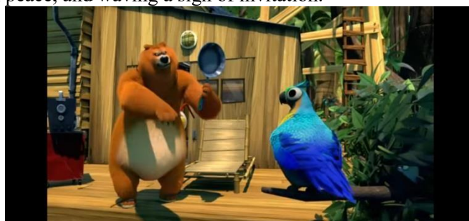
Figure 1 Scene 2.39

These are signs that replace direct phrases, for example a thumbs up sign of agreement, fingers forming a v sign of peace, and waving a sign of invitation.