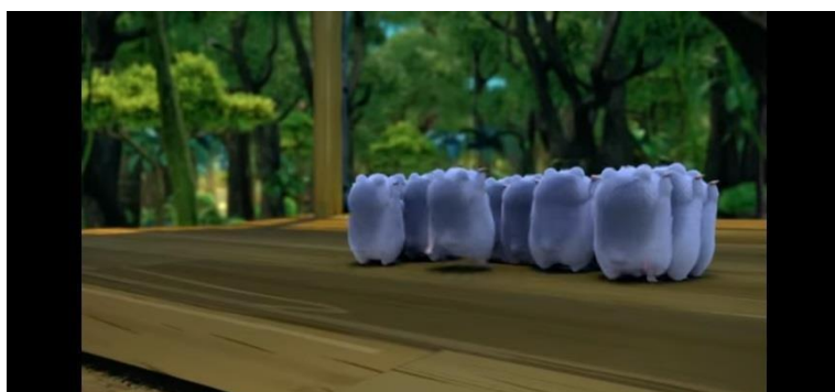
Figure 4.10 scene 1.18

Intimate distance: Distance ranges from 18 inches. A group of lemmings run scared when Grizzly takes a beating and drives the group of lemmings out of his house so Grizzly can hear music on the radio without having to share with the group of lemmings.