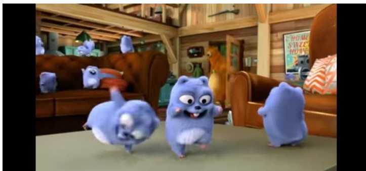
Figure 4.3 Scene 0.34

C. Affect Display, namely gestures that show feelings