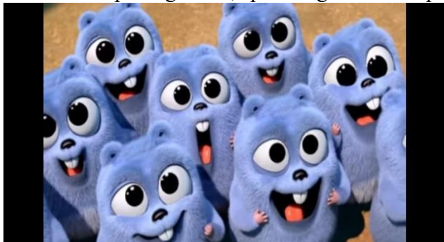
Figure 4.2 Scene 1.55

The illustrator deals with efforts to depict messages, for example making a circle with the hands depicting a ball, spreading arms to depict the length of a train, and so on.