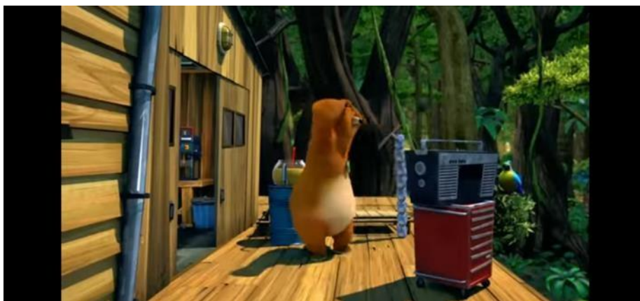
Figure 4.12 scene 3.05

Social distancing: Approximately 4 feet to 12 feet distance. Lemmings wants to hit Grizzly's head so that he faints to make it easier for the lemmings to take the radio without being taken back by Grizzly.