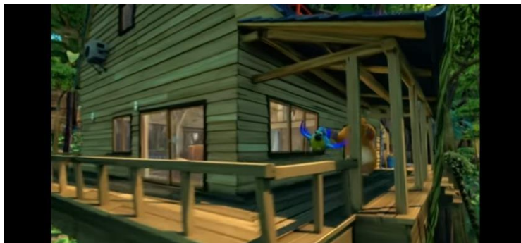
Figure 4.15 Scene 4.58