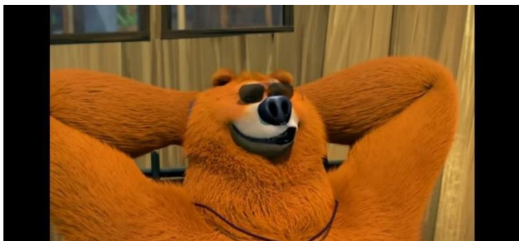
Figure 4.9 Scene 2.17

Grizzly is the main attraction of the Grizzly and les Lemmings animation because he has intelligence and creativity like humans, and it can be seen in this animation that only Grizzly is an animal in the forest, Grizzly has a house where the tools are exactly the same as those of humans and lemmings also often take and borrow Grizzly's stuff. An example of a human object that Grizzly has is shown in Figure 4.9 where Grizzly sits in a lounge chair wearing sunglasses and a necklace.