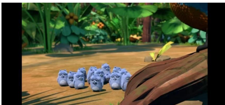
Figure 4.7 Scene 5.23

Lemmings have a short, slender and round body shape. 3. Ectomorph