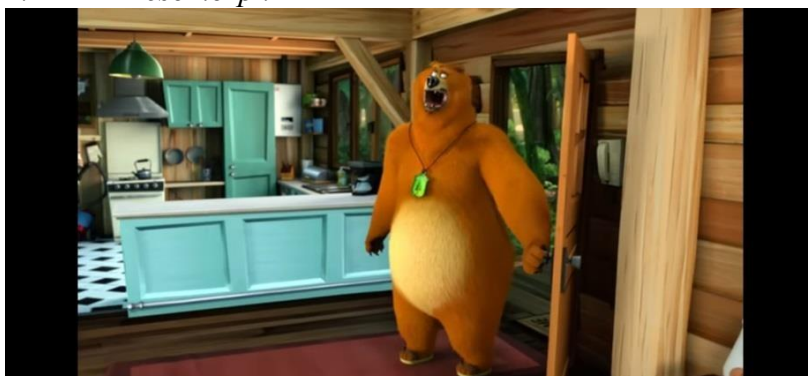
Figure 4.6 Scene 0.38

Grizzly has a body that is not too big and not too thin and muscular.