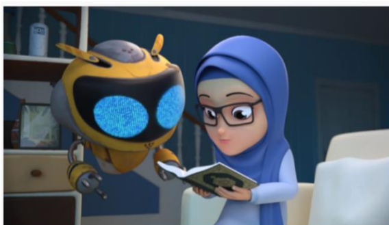
Figure 5. Sis Wulan reads the verses of the Qur'an related to the rain process (Riko The Series, 2021)

Riko is an example of the attitude of Muslim children in everyday life. Riko's expressive and curious character is clearly illustrated through the questions that arise from her. In one of the episodes in the Riko series film entitled "like a chameleon, it is told that Riko imagines being a ninja so that he can disguise himself and cannot be seen by his brother (Riko The Series, n.d.-a, n.d.-c). Kio's character then explains to Riko that it turns out that there are creatures of God that God created far more powerful than ninjas because they can disguise themselves so as not to be caught by their enemies, namely chameleons. Kio's explanation then amazed Riko who then said Masha Allah as an expression of her amazement. At the end of the film, it is explained that in the universe there are many signs of Allah's greatness on earth, along with an invitation to read the find other signs of Allah's greatness, here is one of the letters in the that is read in that episode: