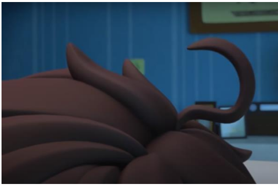
Figure 1. Riko's Hair When You Have Questions (Riko The Series, n.d.-c, n.d.-a, 2021)

world, namely expressive, colorful, cheerful, unique, and filled with curiosity (Maiza & Nurhafizah, 2019; Suryana, 2007, 2018). One of the forms of children's curiosity and expressiveness is depicted in the character Riko, who every time she has a question, some of her hair will stand up like in the picture (Riko The Series, 2021).