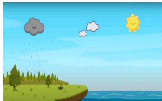
Figure 4. Seen Black Clouds With Falling Raindrops (Riko The Series, 2021)

After the explanation with moving illustrations, the concept of rain is associated with the greatness of Allah and the verses of the concerning rain. In some episodes, the verses of the are read by children while in other episodes, the verses of the are read by characters in the film. Presentation of interesting illustrations and narratives while leaving a positive impression for children in understanding the relationship between the Qur'an and the concept of science.