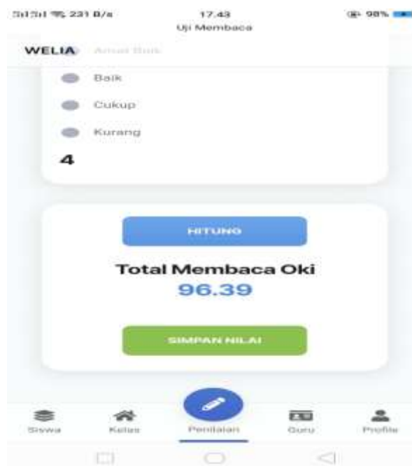
Figure 3. Example Menu for Calculating Linguistic Ability Values on WELIA

and evaluate students by opening or clicking start test.